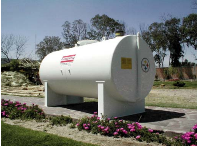
2-Hour 2000° Fire-Tested Performance

FLAMESHIELD® aboveground storage tanks are manufactured with a tight-wrap double-wall design. Standard features include 2-hour fire-tested performance, built-in secondary containment and interstitial monitoring capability.